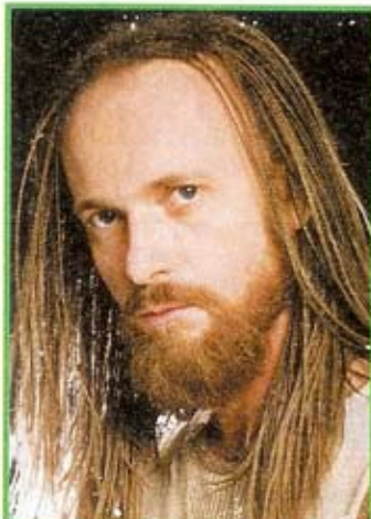
Lord Have Mercy: The actor sported dreadlocks and cornrows in a production of Jesus Christ Superstar .

And what's nice about the bleaching is not so much the color, but the texture you get. My hair is very fine and I like it to stand up and do something, not just lay there. You can achieve that easier with some color explosion in the follicle. Right now, it's weaved brilliantly by John with blonde, white and gray.